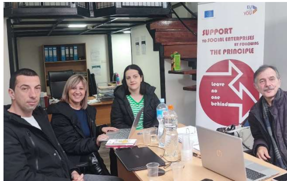
Figure 10 – Monitoring meeting of re-granted organization Rural Coalition