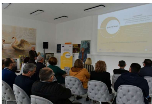
Figure 17 – First meeting of the Local Group of Stakeholders in Radovich