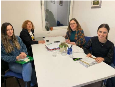
Figure 1 - Working meeting with the selected consultants for the preparation of the publication - Monograph "Together for more opportunities and support" - January 2023

During the entire duration of the project, we strived for comprehensive inclusion by raising public awareness of acceptance and active inclusion of persons with disabilities in all aspects of social life. We express our immense gratitude to the project partners and all other involved persons and stakeholders who provided support and their significant contribution to the successful implementation of this project which brought many positive changes in society.