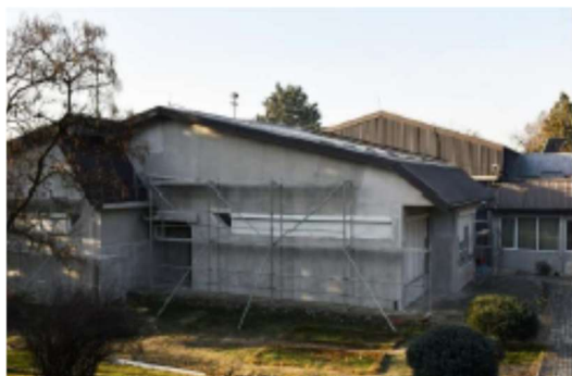
Figure 15 – Measures to improve the EE of the clone "Cvetovi" - Kindergarten "Aco Karamanov" in Radovich

The project is co-financed by the European Union, from the IPA program "EU for Municipalities" which aims to pilot innovative solutions for local problems in municipalities, while strengthening their capacity to deal with their competences, use and adapt best practices solutions from local authorities in EU member states, as well as to improve the involvement of local stakeholders in solving problems.