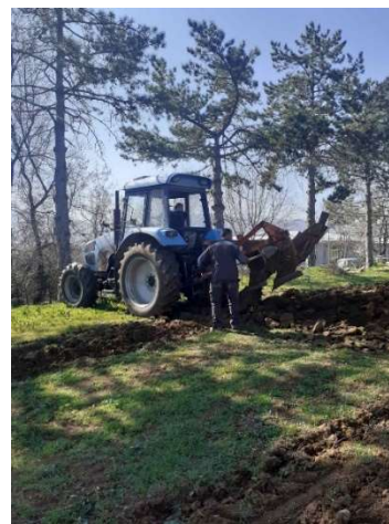
Figure 3 – Part of the therapeutic activities in the established residential units for living with community support by the project – March 2023 Department in JU SZD