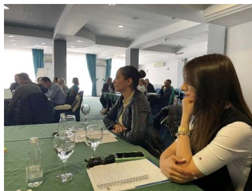
Figure 32 and 33 – Participation in trainings for improvement of the CeProSARD team