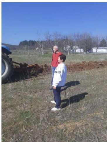
Figure 3 – Part of the therapeutic activities in the established housing units for supported living in the community by the project – March 2023