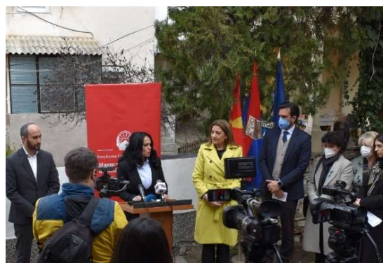
Figure 29 -Opening of a small group home in Veles