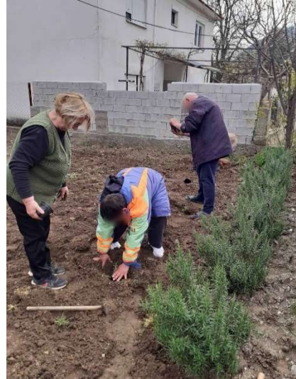
Figure 5 – Дел од окупационите хортикултурни активности во воспоставените станбени единици - април 2023 Демир Капија