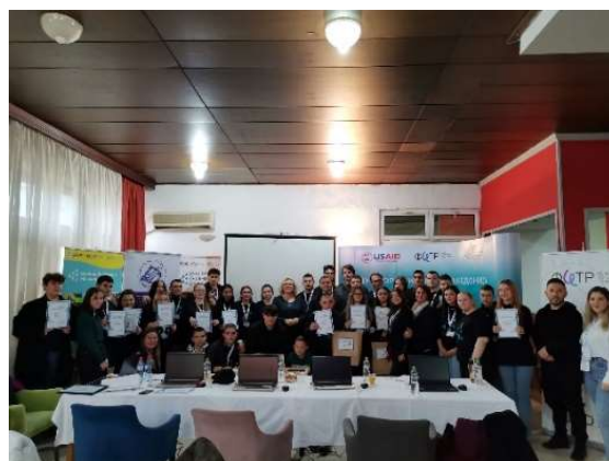
Figure 38 and 39 - The CeProSARD team, part of the jury committee of the Camp for Innovations at SUGS Lazar Tanev in Skopje