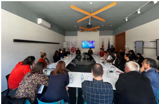
Figure 9 - round table "Challenges and opportunities for the development of the social economy in the Republic of N. Macedonia"

The project worked to improve social entrepreneurship and promote social enterprises in the country by supporting and employing vulnerable groups of citizens. At the event, the participants had the opportunity to see the successful project activities of the re-granted organizations, as well as an exhibition of their products..