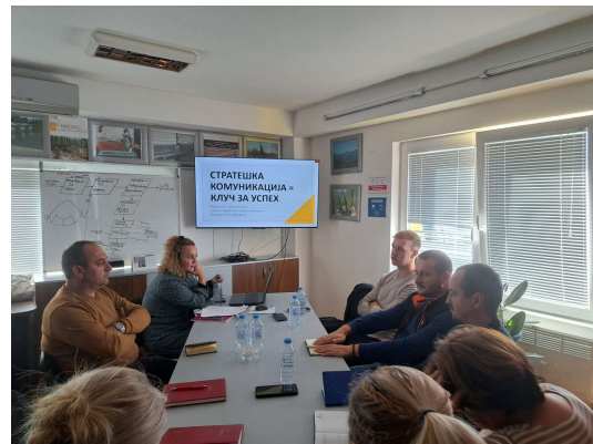
Figure 27 - Training in the premises of "Silgen Resources International" LLC Probishtip