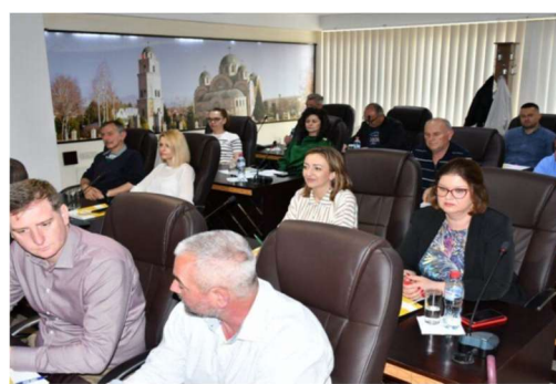
Figure 18 – Transfer of knowledge, experiences and good practices with representatives from the city of Belishce - Croatia