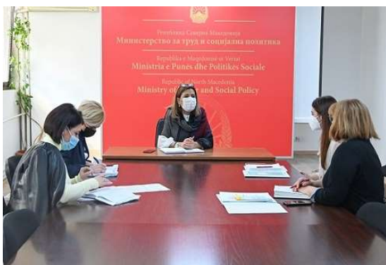
Figure 28 - Meeting at the Ministry of Labor and Social Policy

Some of this information is presented in the following photos: