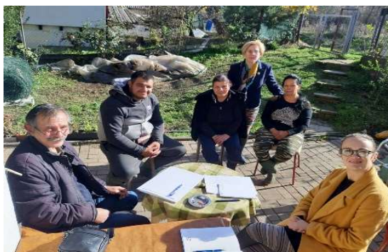
Figure 31 - Field activities - monitoring visits to regranting organizations