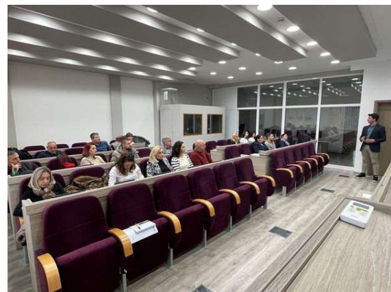
Figure 21 and 22 – Round table - Mapping of entities, their experience, capacities and exchange of experience and identifying interest in cooperation for the establishment of energy cooperatives in the municipality of Medvedja