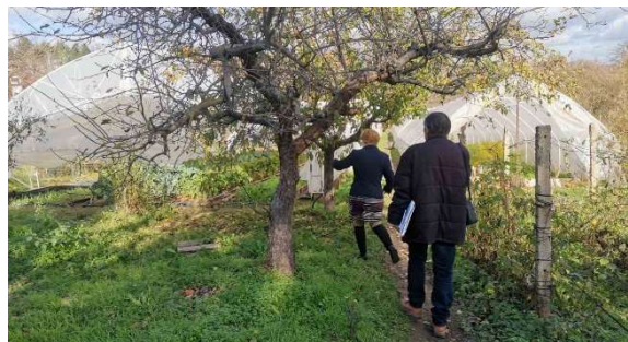
Figure 12 – Field visit to a re-granted organization Akvaponika