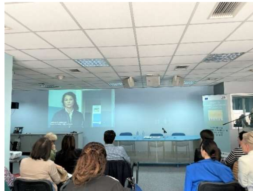
Figure 6 и 8 - Завршен настан на проектот „Заедно за повеќе можности и поддршка – ТИМОР“, простории на Национална и универзитетска библиотека „Св.Климент Охридски“ во Скопје 26.04.2023