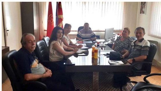
Figure 11 - Meeting with representatives of the local self-government - municipality of Krushevo