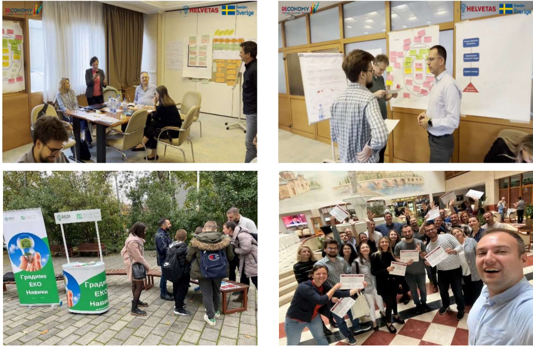
Figure 34 - 37 – Participation in promotional events and trainings for the improvement of the CeProSARD team