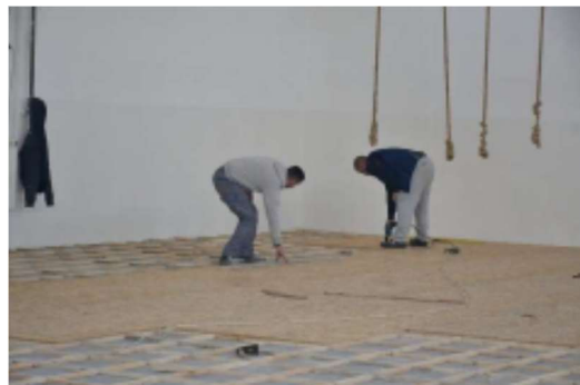
Figure 16 – Measures to improve EE - the sports hall in the secondary school "Kosta Susinov" in Radovich