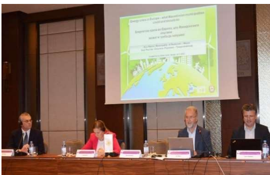
Figure 30 -Promotional event from the Green Heat project