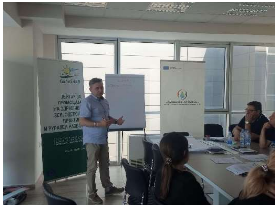
Figure 23 – 26 – Workshops on media water, air, soil, nature and biodiversity and waste, held in the premises of the municipality of Gjore Petrov