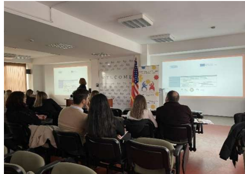
Figure 2 - Promotion of the project in the "Dr. Zlatan Sremets" resource center at an event within the Adapted Accessibility for ALL project - February 2023