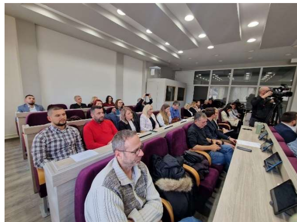
Figure 19 and 20 – Informative event in the municipality of Medvedja