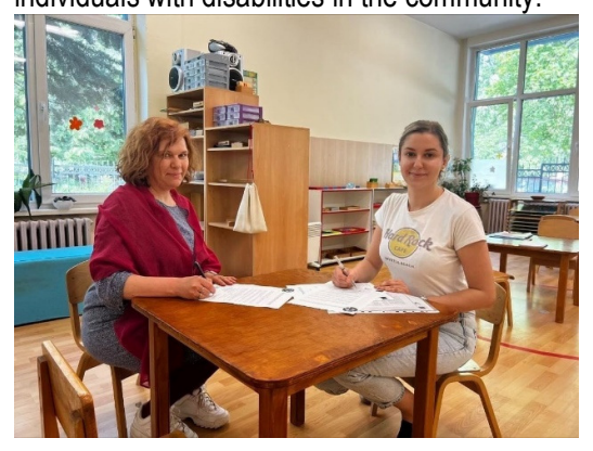
Picture 11 - Working meeting with the Macedonian Montessori Association before the start of the training implementation

Through the education and training for assistants in community-based supported living, the participants had the opportunity to learn about new approaches and methods for providing social services to individuals with disabilities. The theoretical and practical parts of the training covered topics such as modern approaches in supporting the service users, methods of organizing the workplace, healthcare for the service users, and many others. Upon successful completion of the theoretical and practical training, the participants received a certificate as assistants for supported living, providing them with the opportunity for employment in residential units for supported living for individuals with disabilities in the community.