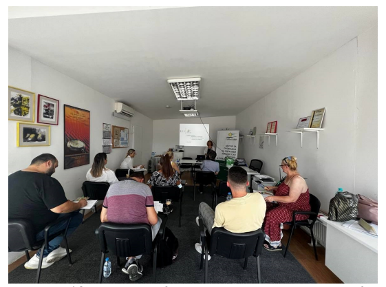
Picture 12 - Part of the theoretical training for assistants in community-based supported living in the premises of CeProSARD.