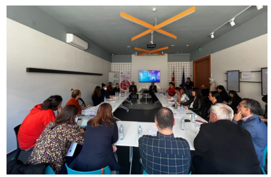
Picture 7 - Round Table: 'Challenges and Opportunities for the Development of the Social Economy in the Republic of North Macedonia"

Within the framework of the project "Supporting Social Enterprises Following the Principle - Leave No One Behind," efforts are being made to support new sustainable employments for at least 9 individuals from vulnerable groups of citizens.