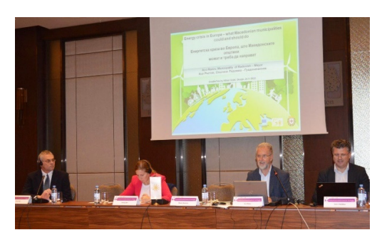
\frac{\text{https://radovis.gov.mk/}\%d0\%be\%d0\%b4\%d1\%80\%d0\%b}{6\%d0\%b0\%d0\%bd0\%d0\%b0}\\ \frac{\text{\%d1}\%82\%d0\%b5\%d0\%bc\%d0\%b0\%d1\%82\%d1\%81\%d}{0\%b4\%d0\%b5\%d0\%b0}\\ \frac{\text{\%d0}\%b4\%d0\%b5\%d0\%b1\%d0\%b0\%d1\%82\%d0\%b0}{\text{\%d0}\%b5\%d0\%b1\%d0\%b5\%d0\%b5\%d0\%b5\%d0}

https://zicpdpveles.com/%D0%B6%D0%B8%D0%B2%D0%B5%D0%B5%D0%B5%D1%81%D0%BE%D0%BF%D0%BE%D0%B4%D0%B4%D1%80%D1%88%D0%BA%D0%BA%D0%BR/D0%BA%D0%BA%D0%BA