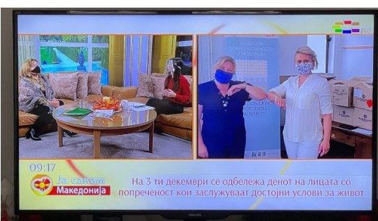
Picture 5 and 6 - Promotion on the occasion of the opening of the first small group home managed by a private service provider in Veles and television appearance on the national service MRT