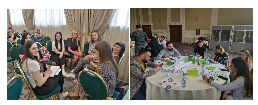
Image 22 и 23 –participation in training by some of the team members of CeProSARD