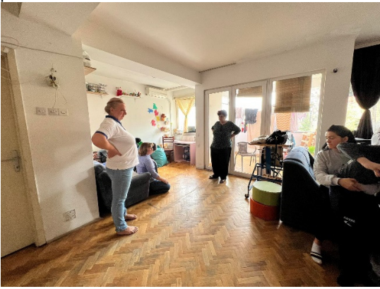
Picture 14 - Practical training in a small group home for supported living in the community