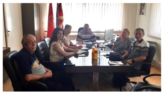
Picture 9 - Meeting with Representatives from the Local Self-Government - Municipality of Resen