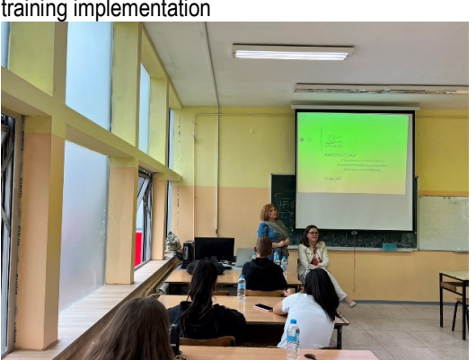
Picture 13 - Part of the theoretical training for assistants in community-based supported living in the premises of the High School 'Marija Kiri Sklodovska