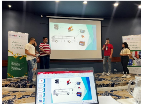
Images 20 and 21 - Part of the atmosphere at the entrepreneurship skills competition