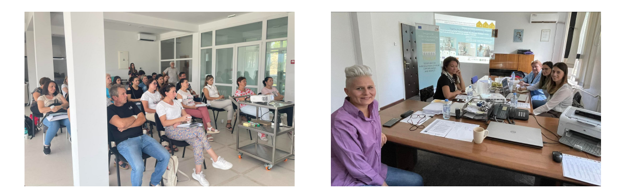
The project is funded by EU IPA II 2017, EU Action Program to support education, employment and social policy support in the process of deinstitutionalization in the social sector.

The project is funded by the European Union.