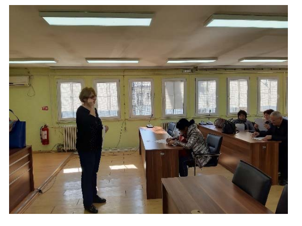
Focus groups organized with councilors and citizens in the municipality of Centar, 2019