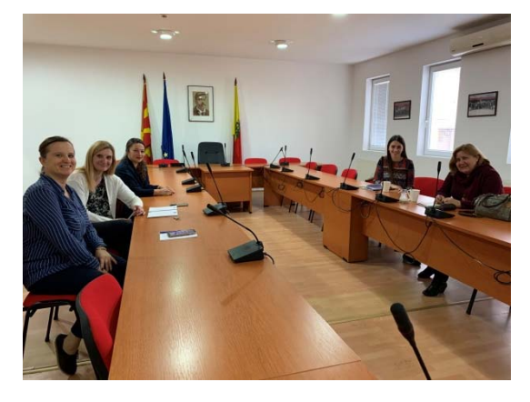
Information meeting of the municipality of Butel, November 2019.