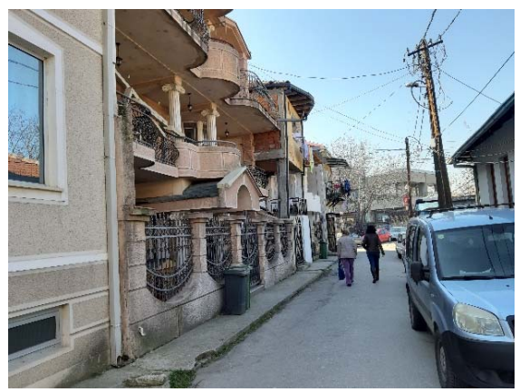
Municipality of Centar, Tito Veleska Street, reconstruction of water supply system, 2019