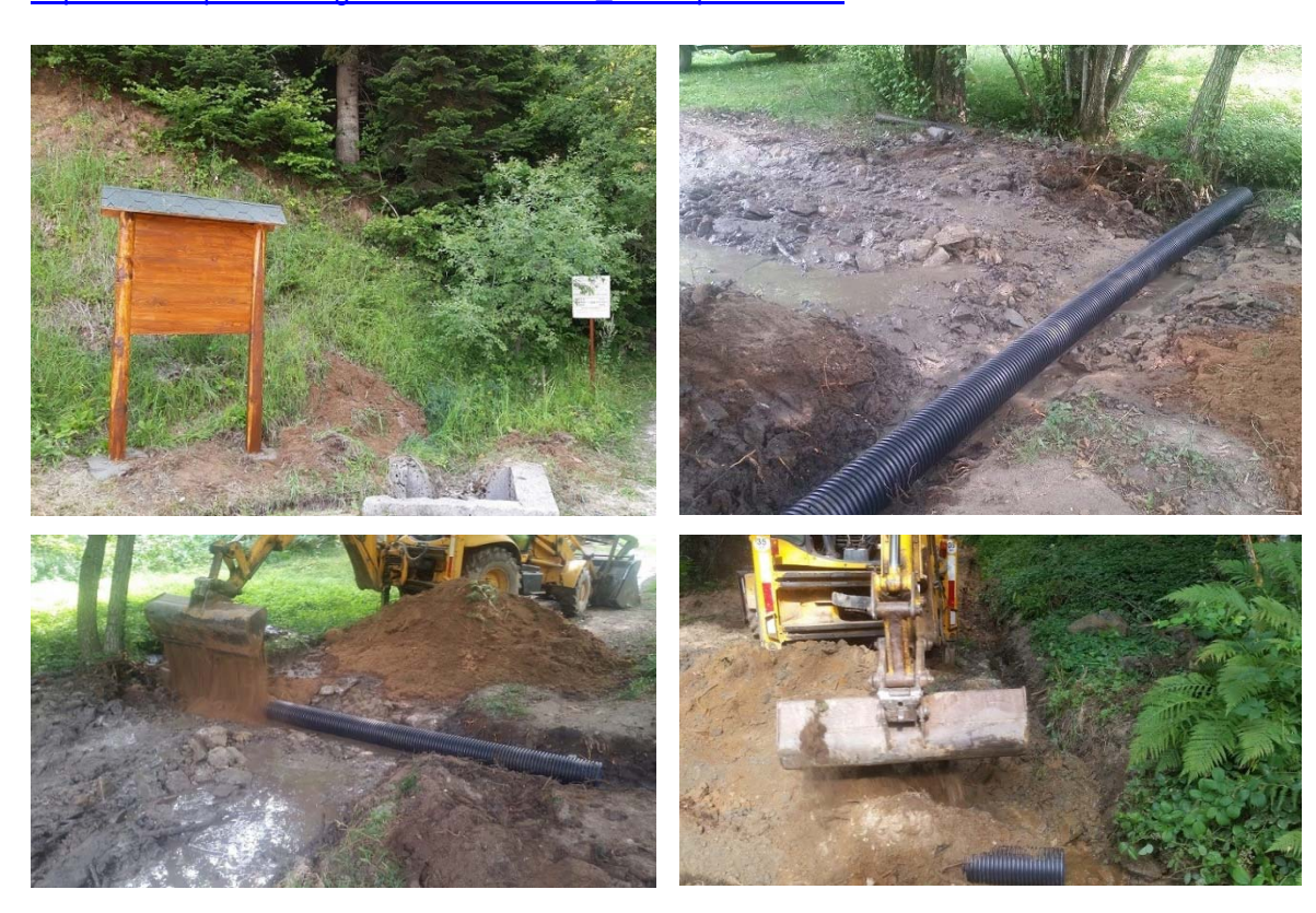
Revitalization and marking of bicycle paths in NP Pelister, July 2019

http://www.ceprosard.org.mk/MK/Aktuelnosti info.aspx?cid=376 http://www.ceprosard.org.mk/MK/Aktuelnosti info.aspx?cid=396 http://www.ceprosard.org.mk/MK/Aktuelnosti info.aspx?cid=403 http://www.ceprosard.org.mk/MK/Aktuelnosti info.aspx?cid=429 http://www.ceprosard.org.mk/MK/Aktuelnosti info.aspx?cid=436 http://www.ceprosard.org.mk/MK/Aktuelnosti info.aspx?cid=455 http://www.ceprosard.org.mk/MK/Aktuelnosti info.aspx?cid=463 http://www.ceprosard.org.mk/MK/Aktuelnosti info.aspx?cid=470 http://www.ceprosard.org.mk/MK/Aktuelnosti info.aspx?cid=480 http://www.ceprosard.org.mk/MK/Aktuelnosti info.aspx?cid=481 http://www.ceprosard.org.mk/MK/Aktuelnosti info.aspx?cid=482 http://www.ceprosard.org.mk/MK/Aktuelnosti info.aspx?cid=483