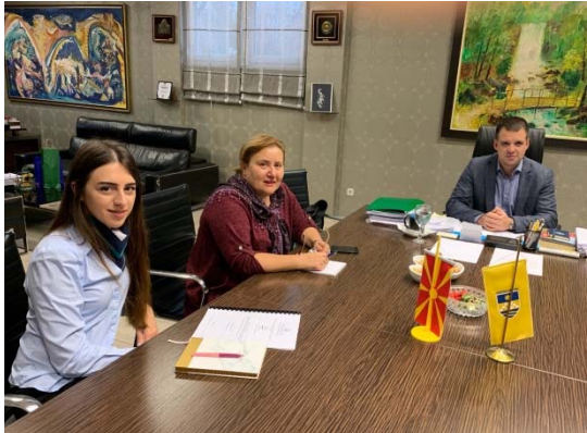
Information meetings with the municipalities of Suto Orizari and Karpos, November 2019