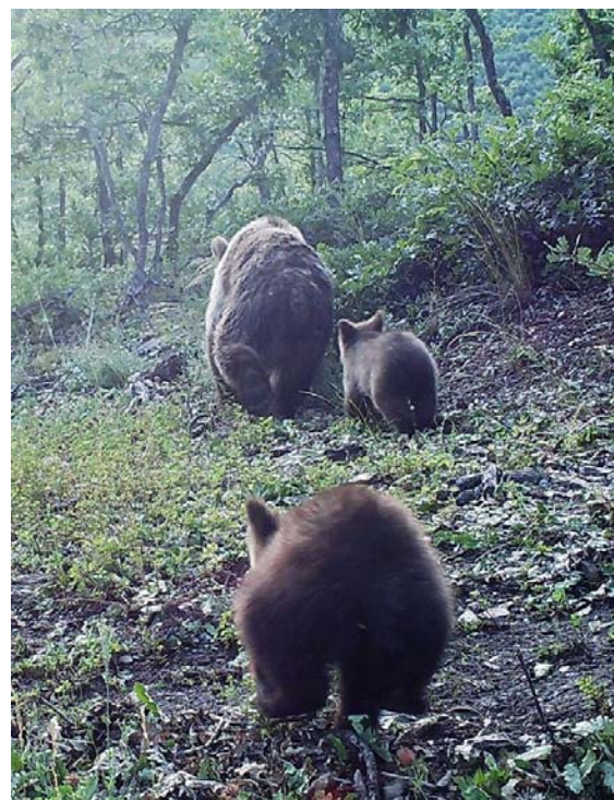
Animal monitoring in Pelister National Park, 2019