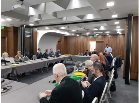
Second consultative meeting of stakeholders from the cross-border region of Shara, held at the NB Hotel and Spa in Tetovo, on November 27, 2019